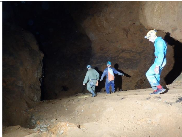
The main incline in Udias mine