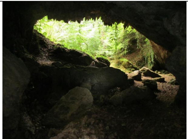
Cueva del Valle near Rasines