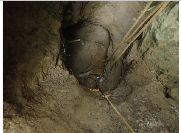
Dig 2101 towards the end