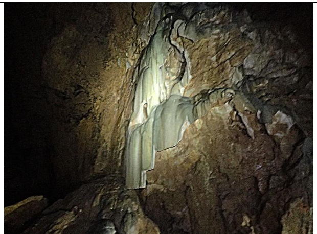
In the natural cave below Udias mine