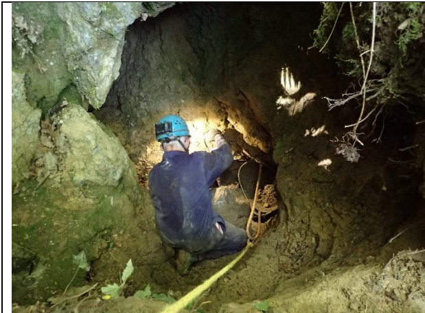
Dig 2101 at start of work