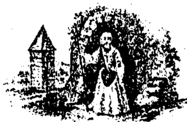
Derbyshire Caving Club – April 2025